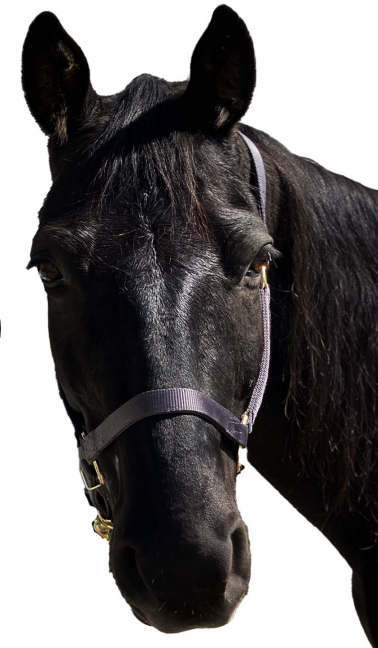
Sam, a member of our herd